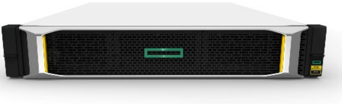
HPE MSA 2052 SAN Storage