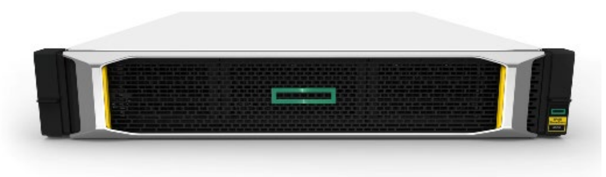
HPE MSA 2050 SAN Storage