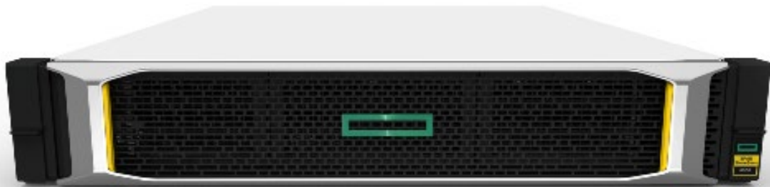
HPE MSA 2050 SAN Storage